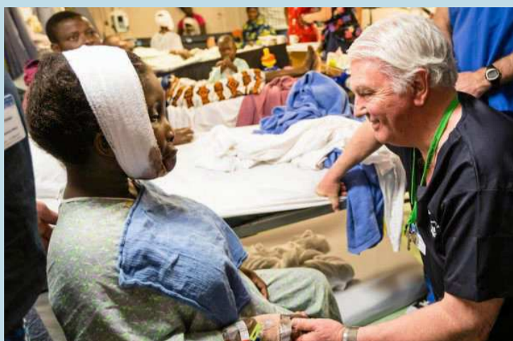
DOUBLE JOY: Mercy Ships Cargo Day has beaten its target to raise more than twice the $300,000 of last year's event

He said: "Africa is also the perfect place to help. Not only because